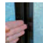
No pinch seams