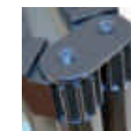
360 degree panel hinges