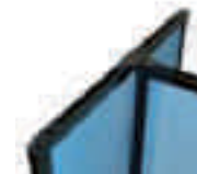
Full panel end member