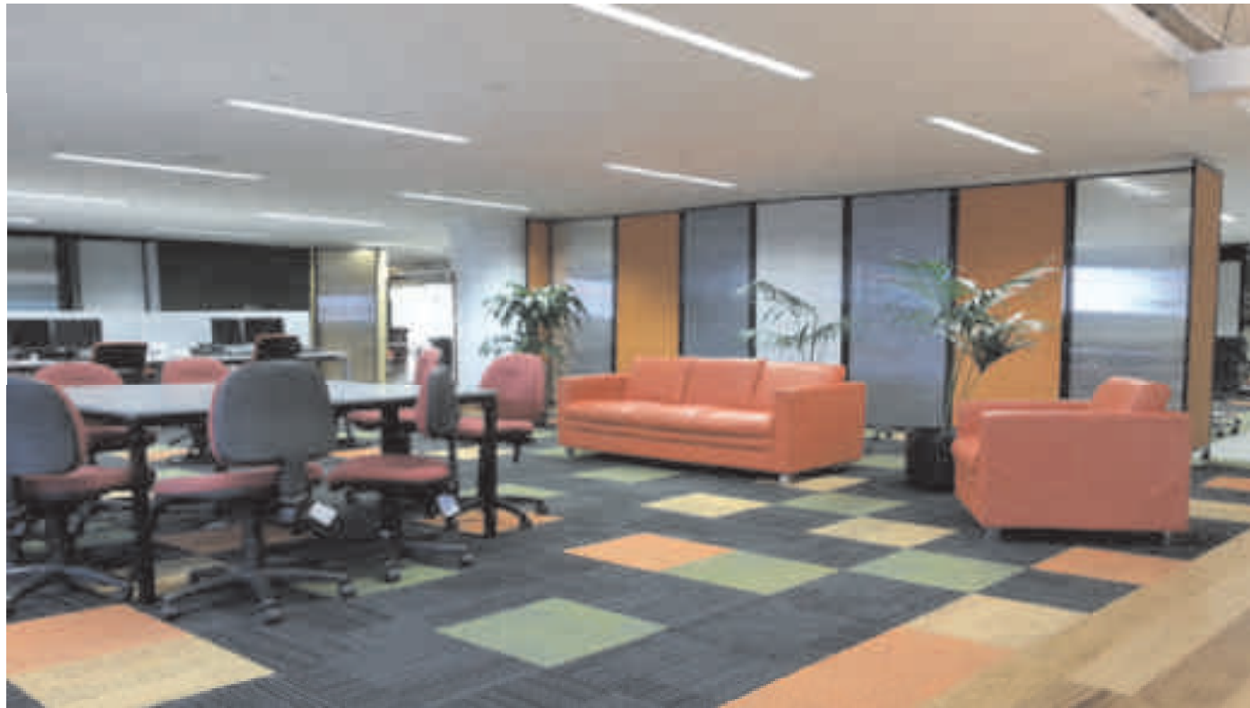
Transform and better utilise office spaces using bespoke colours and finishes