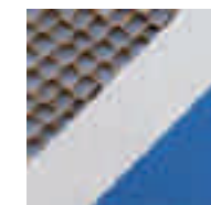
Honeycomb acoustic panels