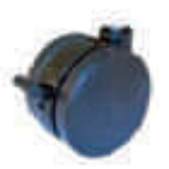
Lockable 3inch castor wheels