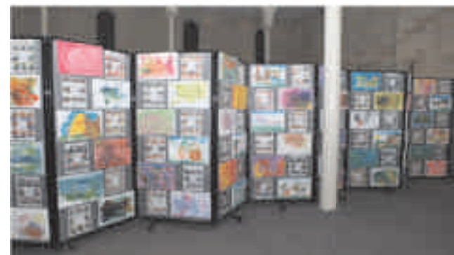
Using room dividers to create an eye-catching mobile gallery within this Childcare Centre