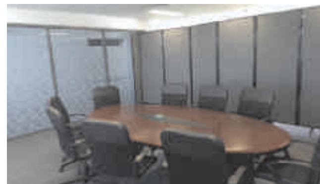
Flexible and adaptable office partitioning solutions - no expensive building works required!