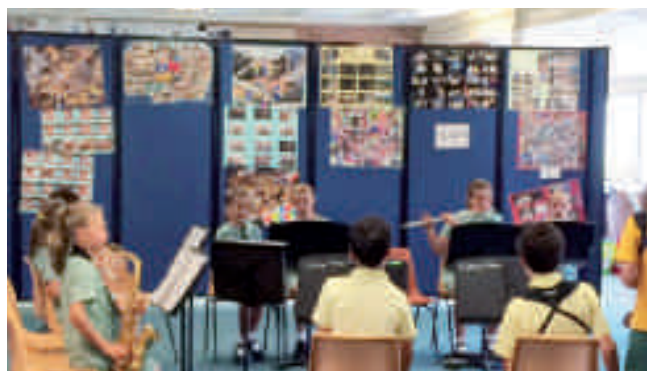
Classroom dividers remain one of most popular product applications, largely due to flexibility and acoustic properties