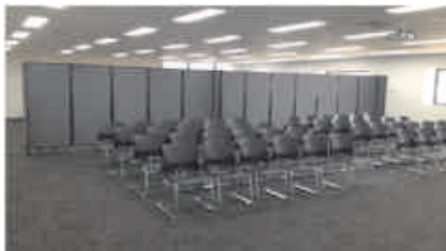
Quickly and easily split large cavernous spaces within offices to create multi-purpose meeting rooms